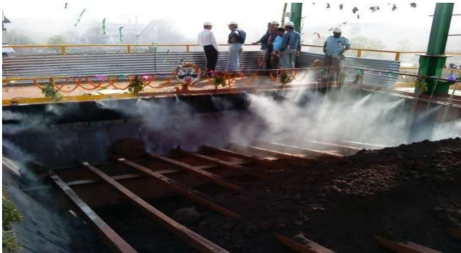
Fig: Cold Fog Dust Suppression System