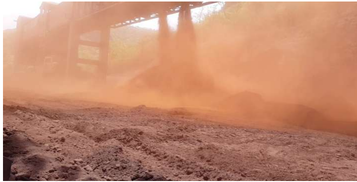
Fig: Iron Ore discharge from tipper (without DSS)