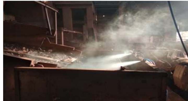
Fig: Screen House (with Dust Suppression System)