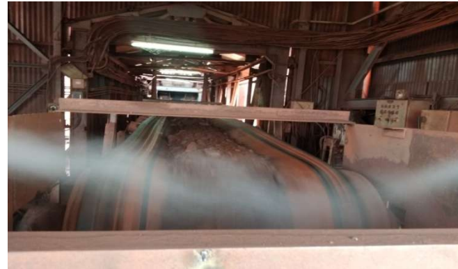
Fig: Cold Fog Dust suppression System at discharge of conveyor