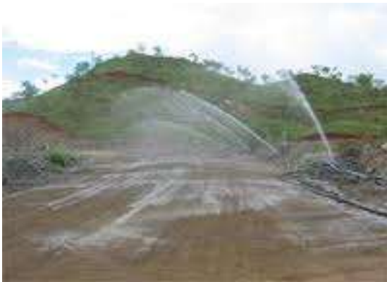
Haul Road Sprinkling