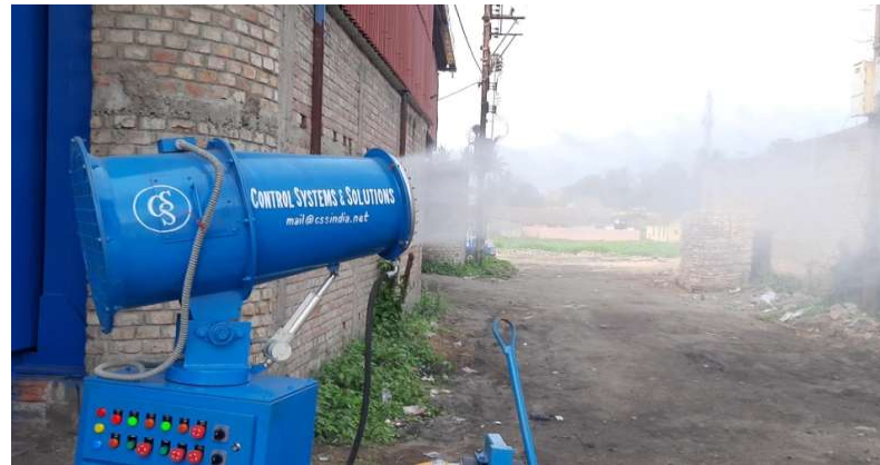
Fig: Fog Canon