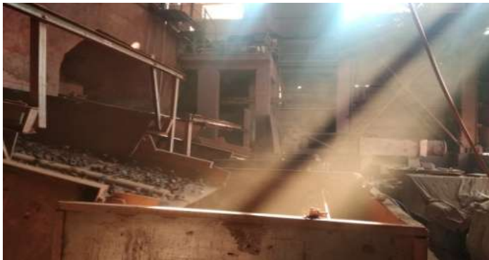
Fig: Screen House (without Dust Suppression System)