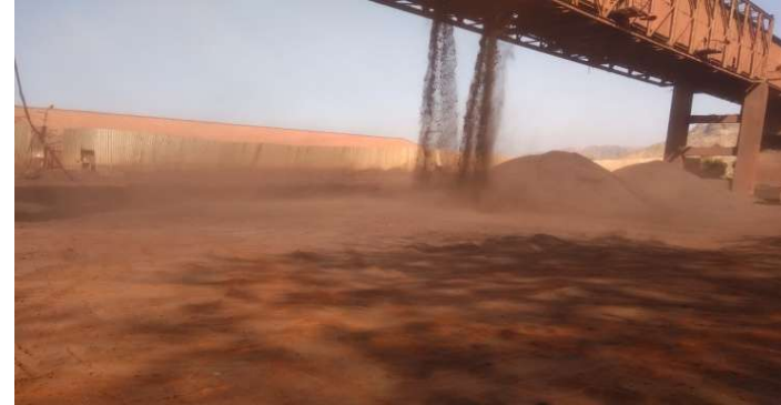
Fig: Iron Ore discharge from tipper (with DSS)